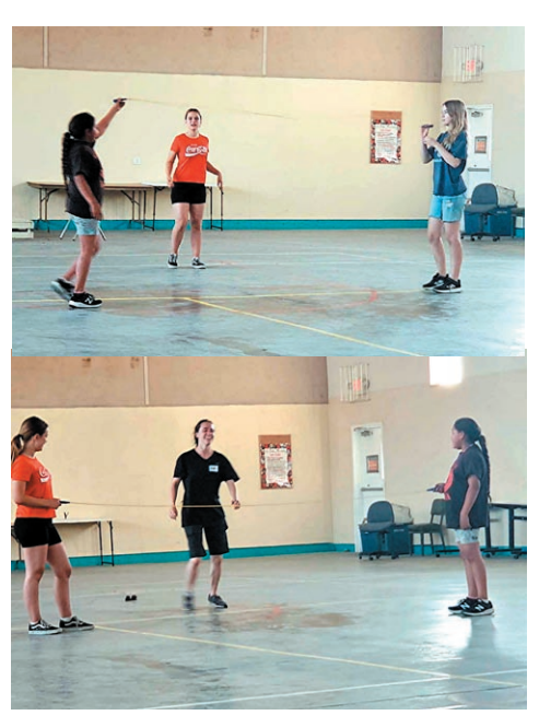
Despite all the work that Oceanside Mission Group accomplished, there was still some time and energy left for recreation!

Thank you to all of the donors who make a difference at La Vida!